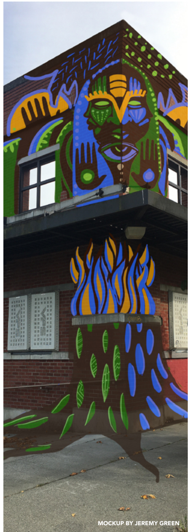
MOCKUP BY JEREMY GREEN