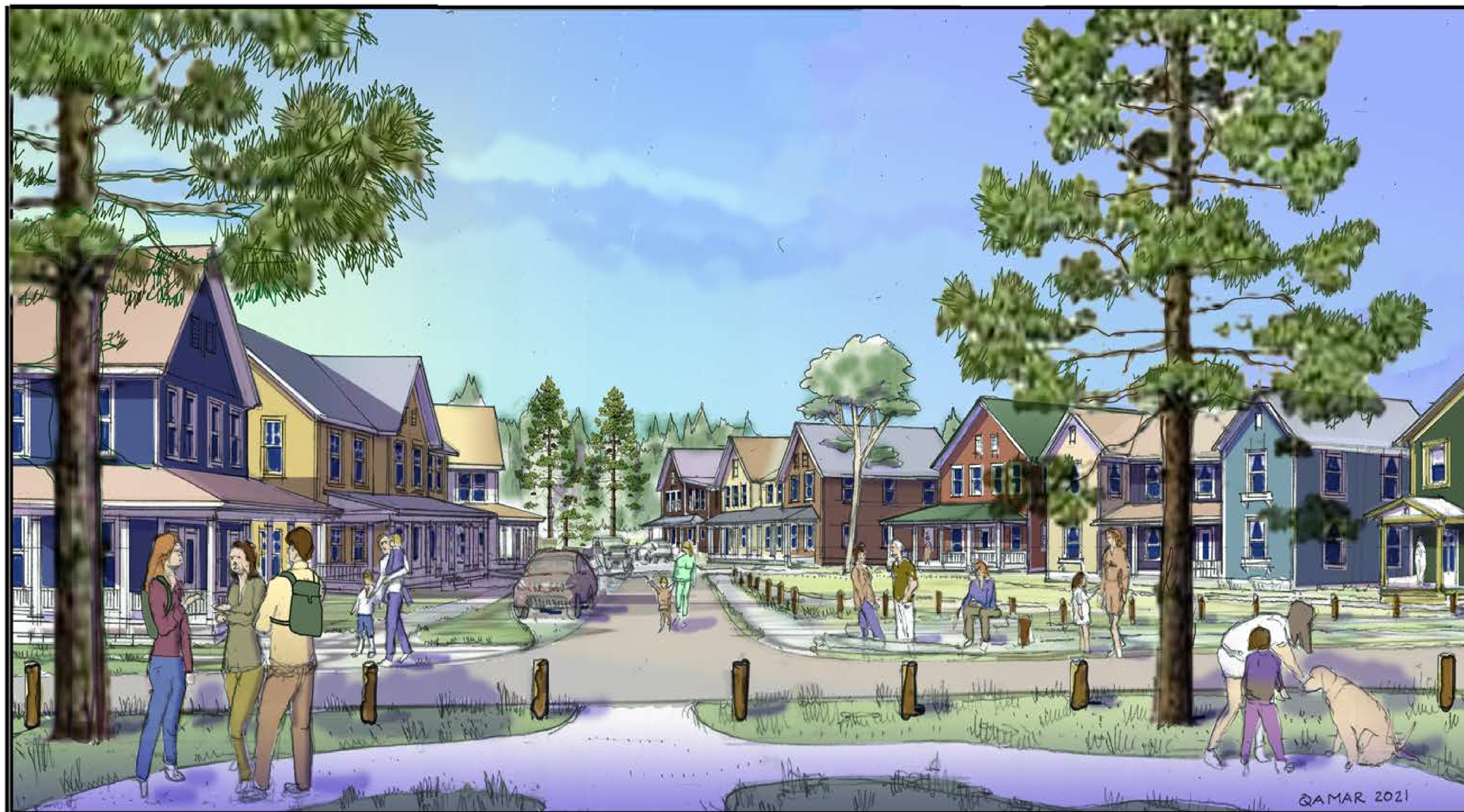
Perspective Looking West

*Not final designs. Will change with community input.