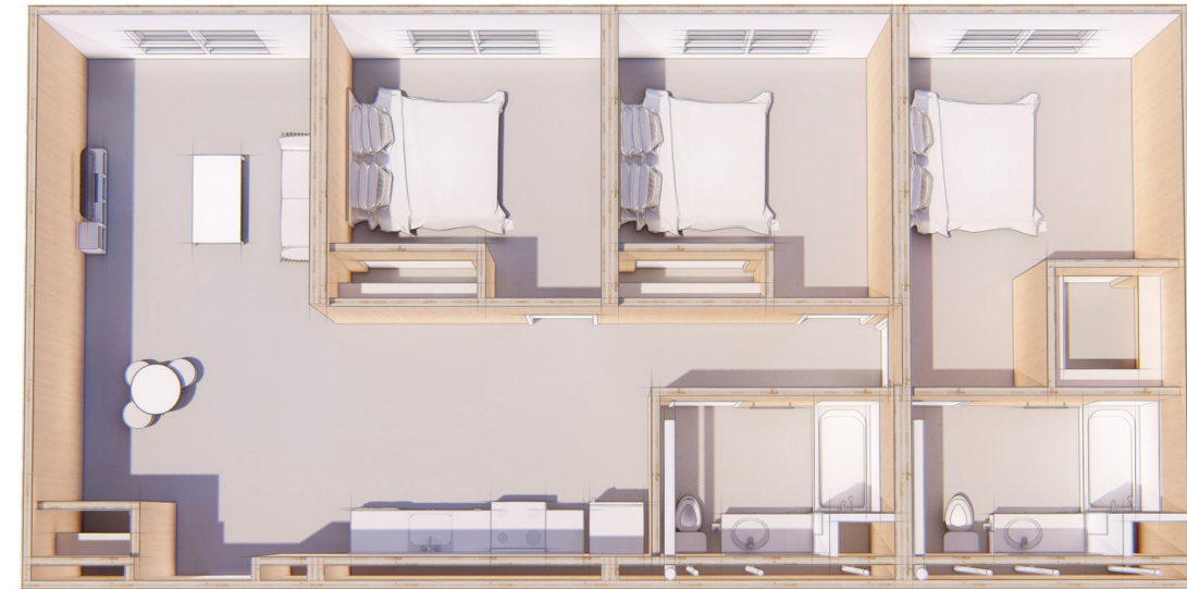
3 BEDROOM: 1186 sq ft