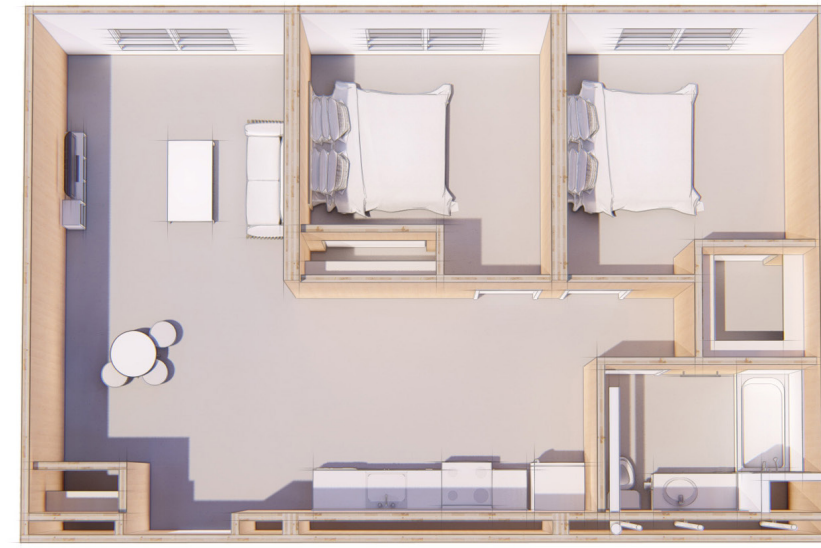
2 BEDROOM: 893 sq ft