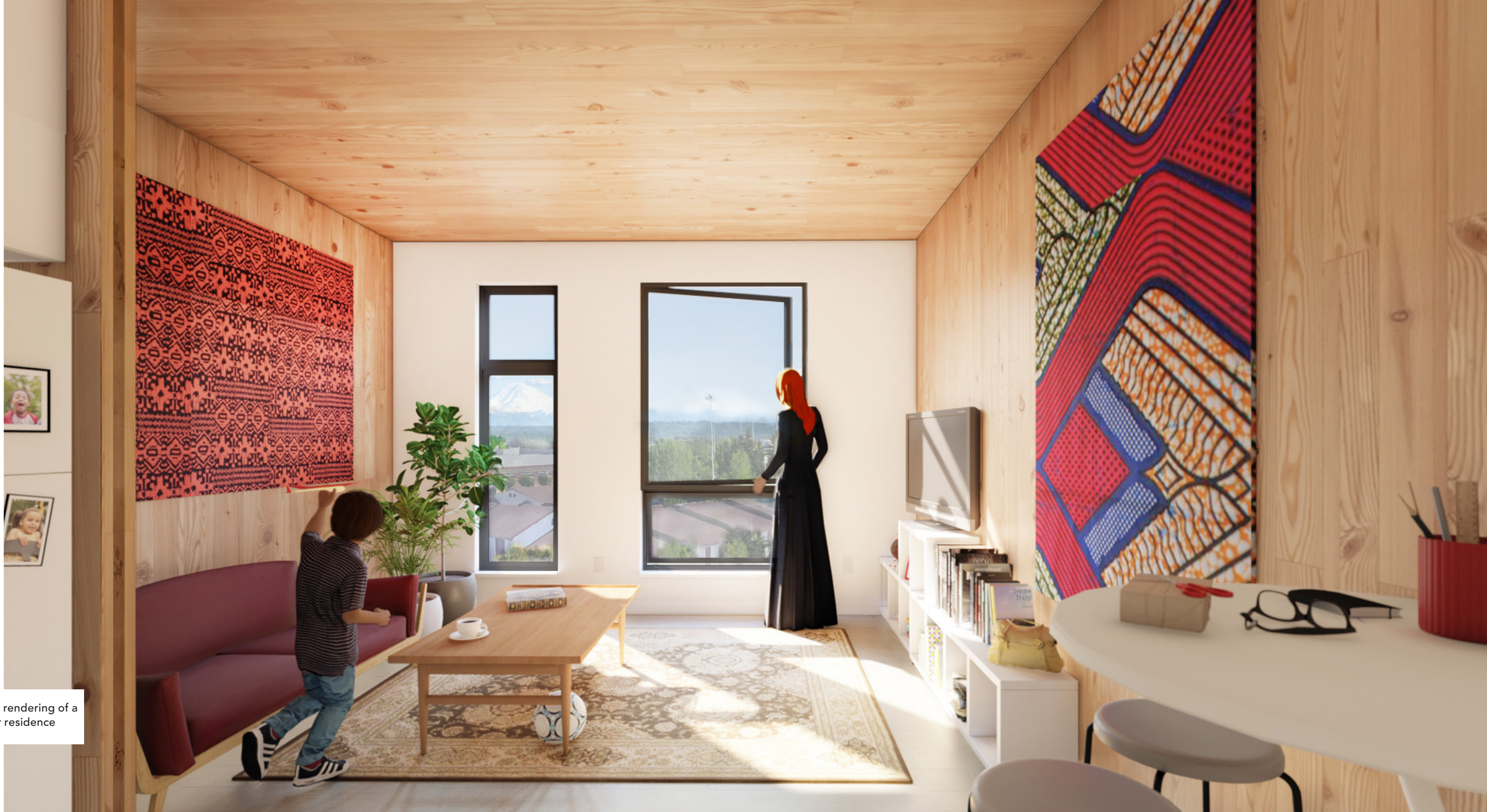
Interior rendering of a Wadajir residence