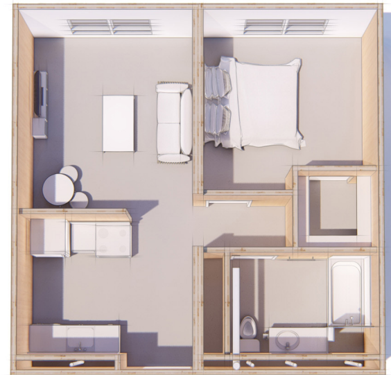
1 BEDROOM: 593 sq ft