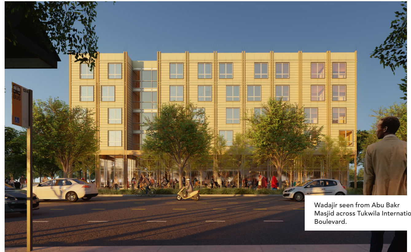
Wadajir seen from Abu Bakr Masjid across Tukwila International Boulevard.