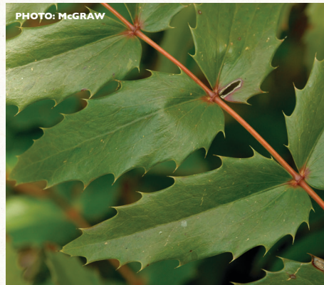
Oregon grape ( Mahonia aquifolium )