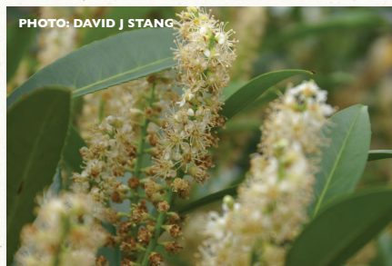
English/Portuguese Laurel ( Prunus laurocerasus )