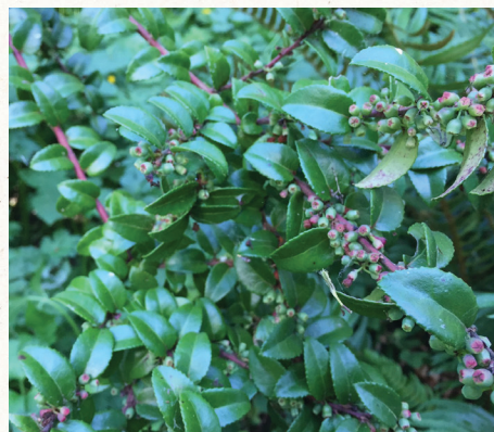
Evergreen huckleberry ( Vaccinium ovatum )