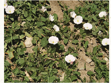
Morning glory/ field bindweed ( Convolvulus arvensis )