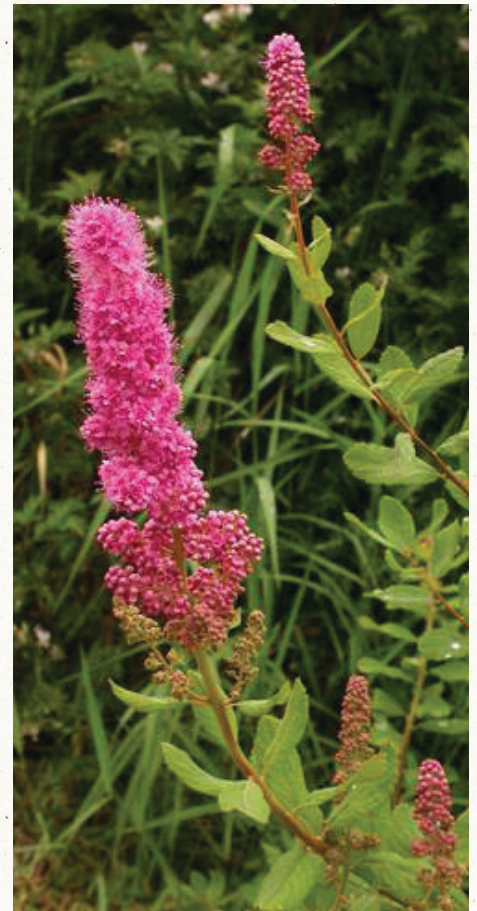
Hardhack/Spirea ( Spiraea douglasii )