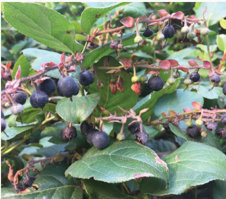
Salal ( Gaultheria shallon )