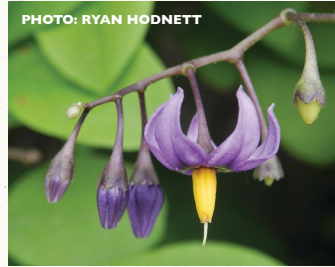
Bittersweet nightshade ( Solanum dulcamara )