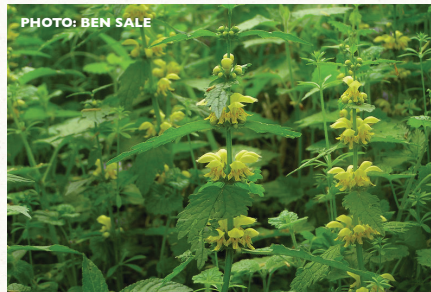
Yellow archangel ( Lamium galeobdolon )