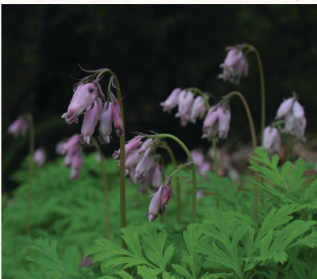
Bleeding heart ( Lamprocapnos spectabilis )