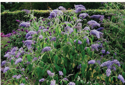
Butterfly bush ( Buddleia davidii )