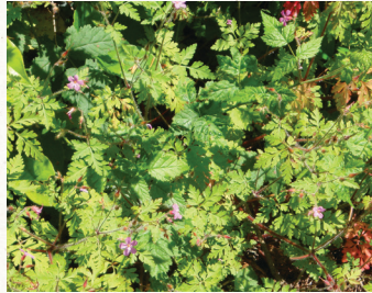
Herb Robert ( Geranium robertianum )