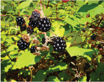
Himalayan blackberry ( Rubus armeniacus )

The following plants are weeds both in our forests and in your landscape, remove them early so they don't establish in your yard.