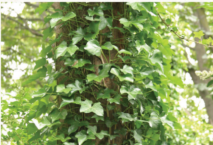
English ivy ( Hedera helix )

These are common landscape plants sold in nurseries and are planted in yards but they can spread from yards into natural areas. Avoid planting them on your property and consider removing them. The following page offers great native alternatives.