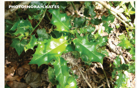
English holly ( Ilex aquifolium )