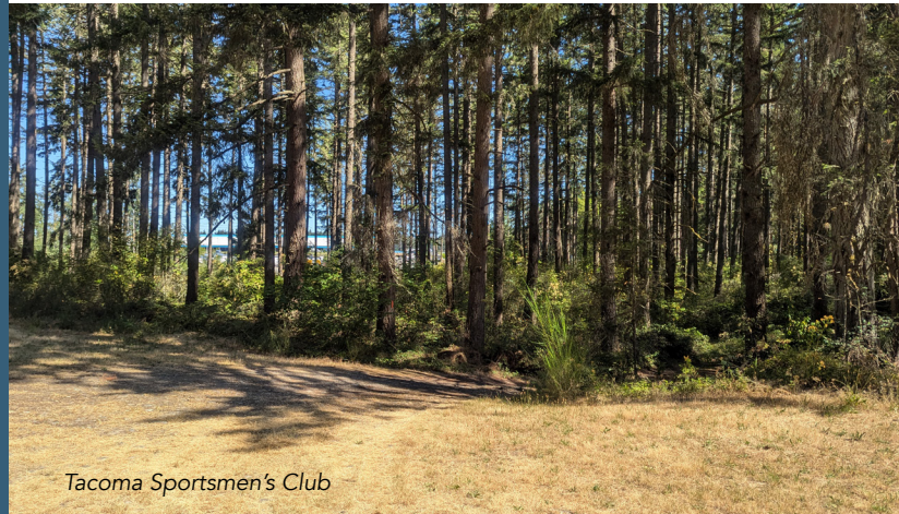
Tacoma Sportsmen's Club